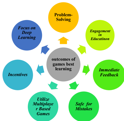
Fig. 2 Summarize outcomes of game-based learning